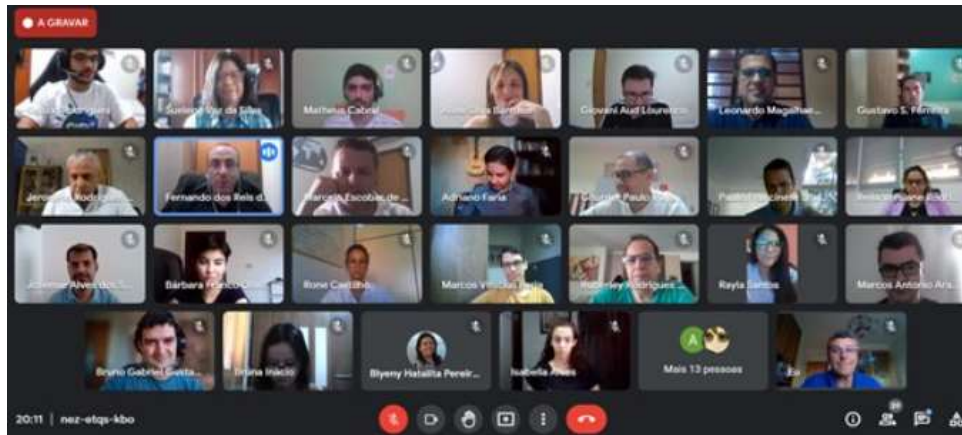
Figure 8- Online Preparation/Training for LAPASSION@Pelotas