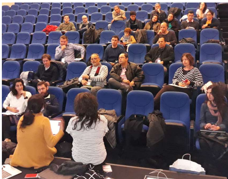
Figure 2- Preparation/Training in Santiago during the last week of LAPASSION@Santiago

In the case of the first edition, it was decided to organize the Preparation/Training session in two moments and during the development of the project, in spite of before the development (see figure 2). The main reasons for that were: