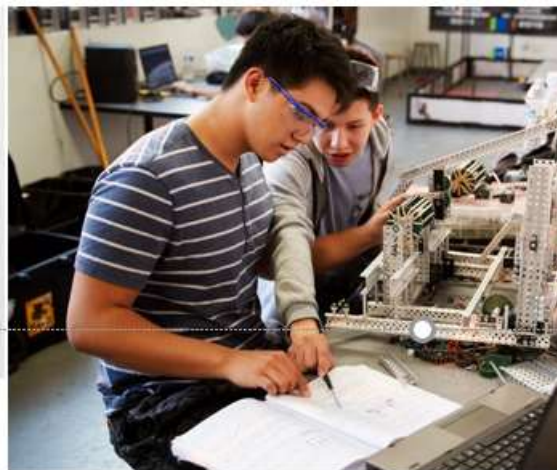
Figure 5- IFMaker Spaces in Brazil were motivated by Project LAPASSION