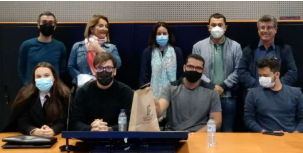
Figure 7- Preparation/Training in Porto (Portugal) in September 2021

Another need was to promote preparation/training for the development of online projects, namely for LAPASSION@Pelotas. In June 2021 a preparation/training week was organized for the professors and coaches of Federal Institute Sul-Riograndense (IFSul) in order to prepare them for online multidisciplinary projects.