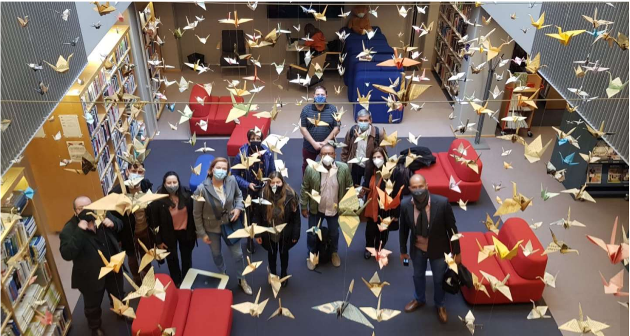
Figure 6- Preparation/Training in Tampere (Finland) in September 2021