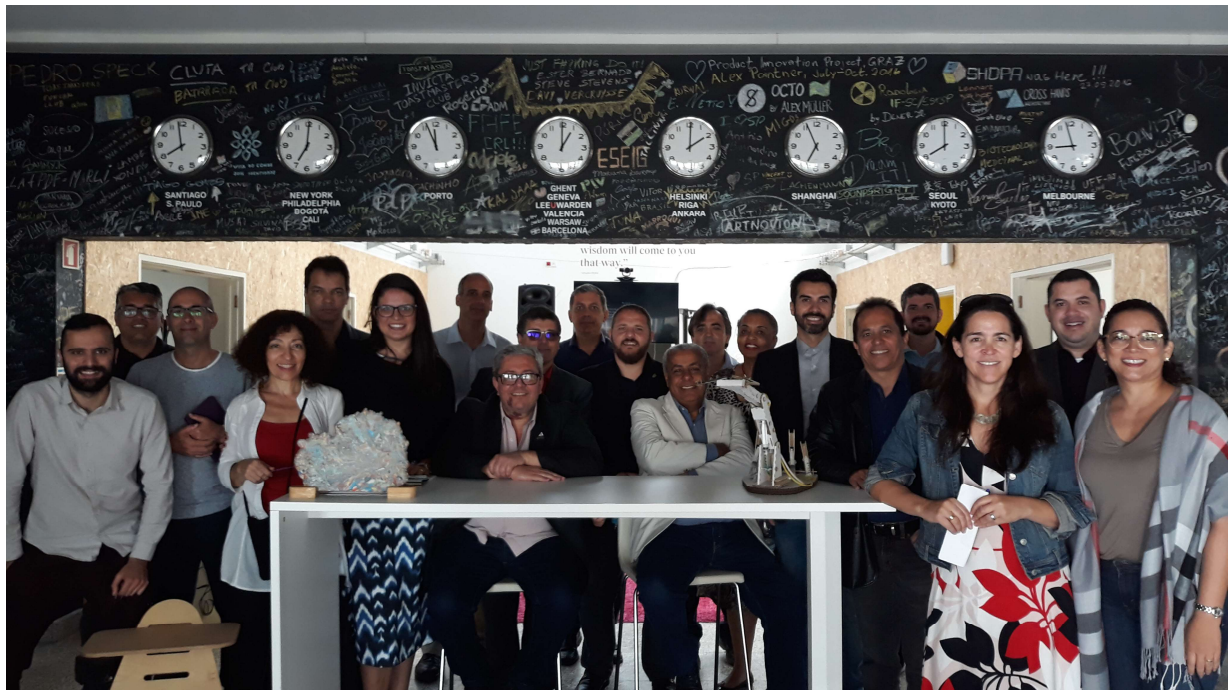
Figure 3- Preparation/Training in Porto

Brazilian and Uruguayan partners that were at a different level of the Chilean partners concerning Multidisciplinary projects experience. Notice that in this week it was possible to join several other participants (from the Quality meeting) and testify the students' teams operation, and the Demo Day with the speeches of the teams