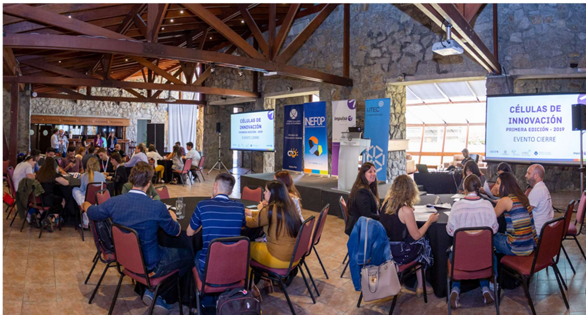
Figure 7 –Pitches of students’ teams of the initiative Células de Innovación, based in LAPASSION practices, Montevideo, December 2019

The main decisions of this meeting were the following: