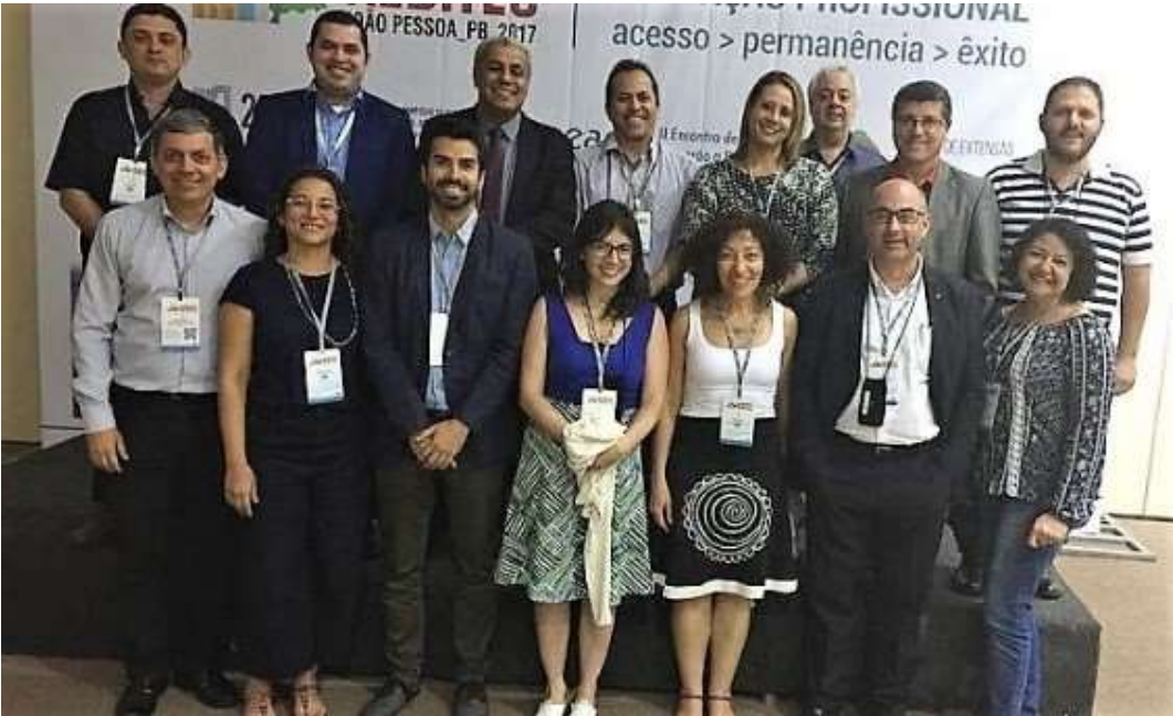
Figure 2 – Participants in the 1st Management Meeting in João Pessoa, Brazil, November 2017

The main decisions of this meeting were the following: