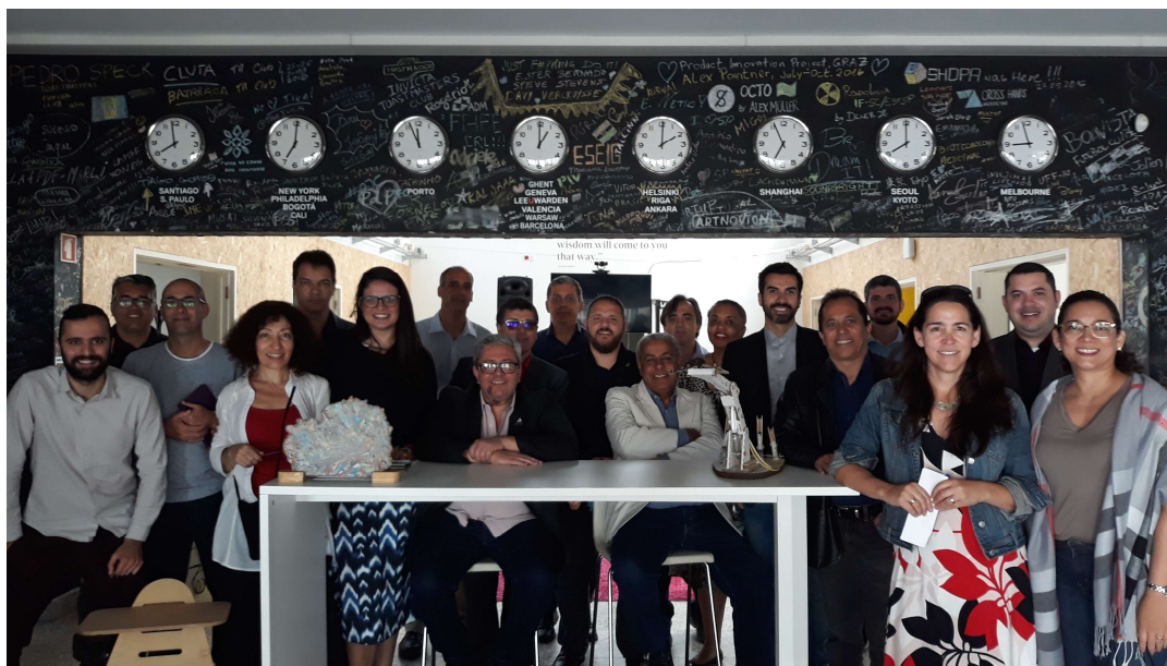
Figure 5 – Visit to Porto Design Factory during the Management Meeting of Porto, June 2019

LAPASSION@Uruguay, LAPASSION@Uberaba, and LAPASSION@SãoLuís. With the success in these three edition of multidisciplinary students teams' projects LAPASSION has achieved the cruising speed, and now the consortium has a much better idea of problems that may happen, and how to handle them, so the consortium considered as very positive the experience till the meeting. On May 21 st EACEA has sent the result of the evaluation of the Intermediate Technical Report, and it has been approved and qualified as "GOOD". The Statement of Costs was also analysed and approved and EACEA decided to transfer the second part of the budget with 40% of the total. This amount was already received by IPP.