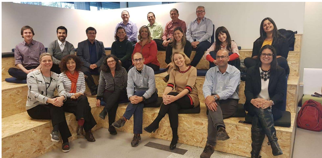
Figure 4 – Participants in the 3rd Management Meeting organized in Tampere, September 2018

The meeting was also an opportunity to know some of the most innovative structures of the University of Applied Sciences of Tampere (TAMK), namely Proakatemia and Y-Campus, where students apply methods that are used now in LAPASSION.