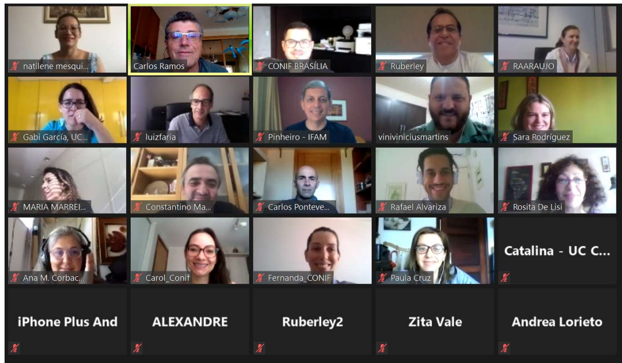
Figure 8 –6th Management Meeting of LAPASSION, online, October 2020

If everything run well, almost as planned in the LAPASSION project proposal till the end of 2019 the year of 2020 was itself a challenge for the project. News about a health problem in China appeared