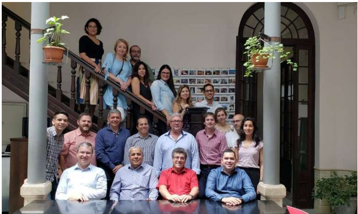
Figure 6 –Management Meeting of Montevideo, December 2019

LAPASSION project is approaching the end and after a successful execution of the Preparation and Development activities and the impact the project had in the institutions where the activities were held, and for the enterprises/organizations involved with the project this Management Meeting prepared the activities for 2020, in which the last 4 editions of development projects will be held. During the meeting it was the opportunity to see the Demo Day of the initiative “Células de Innovación” with students’ teams projects based in LAPASSION practices, joining students from UTEC and other Universities, like UTU (Universidad del Trabajo de Uruguay) and challenges posed by enterprises.