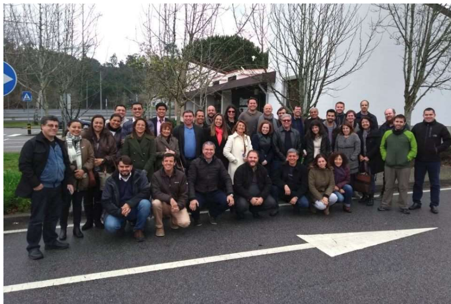
Figure 3 – Participants in the 2nd Management Meeting organized in Porto and Pontevedra, February-March 2018

The main decisions of this meeting were the following: