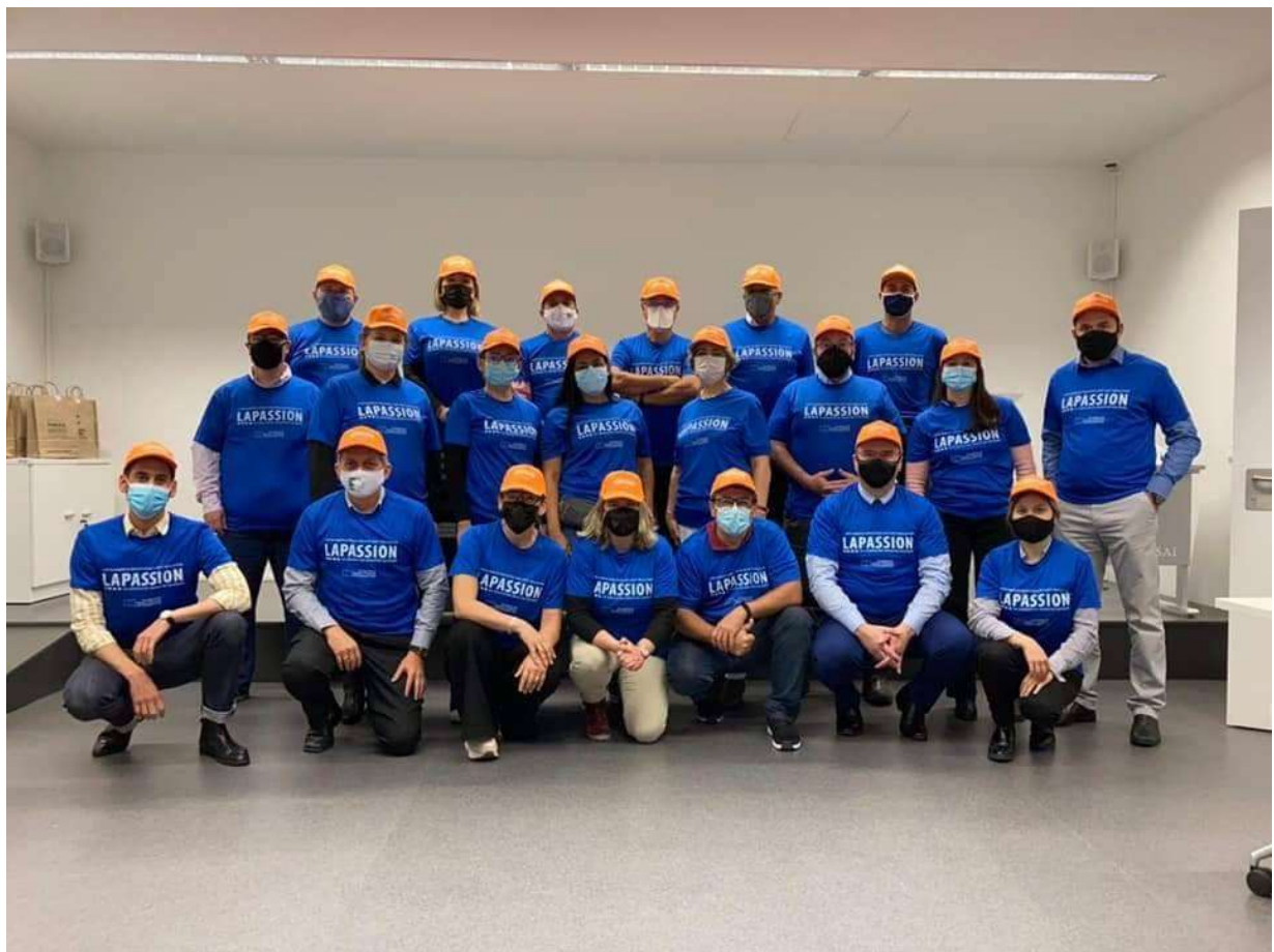
Figure 10 –8th Management Meeting of LAPASSION, back to presential again!, Salamanca, September 2021